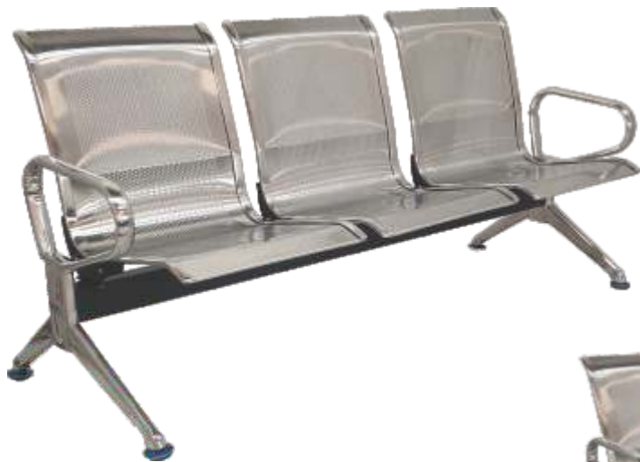
■ SS-3 Seater