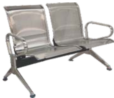
■ SS-2 Seater