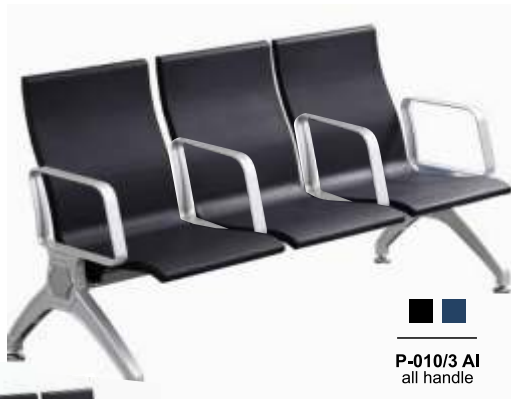
P-010/3 AI all handle